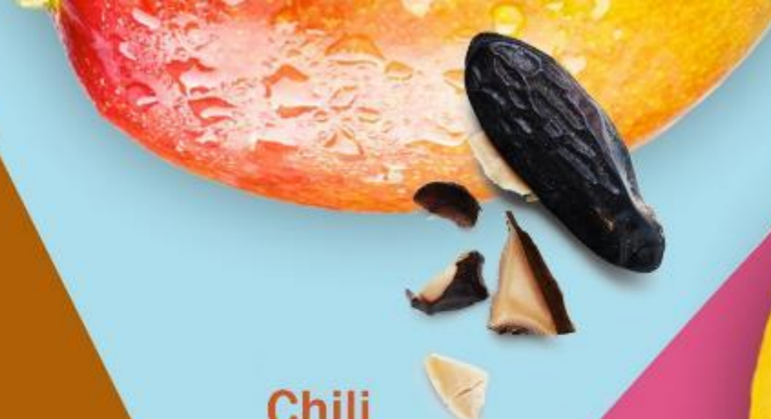
Chili Mango & Tonka Bean