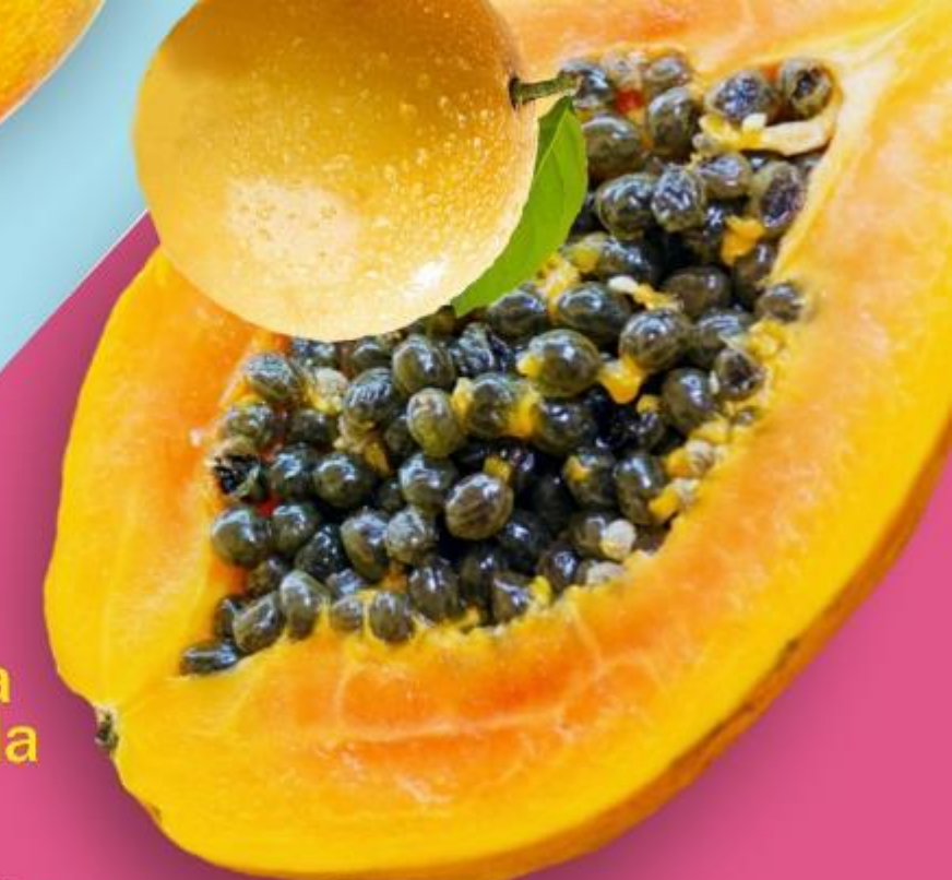
Thai Papaya & Marula