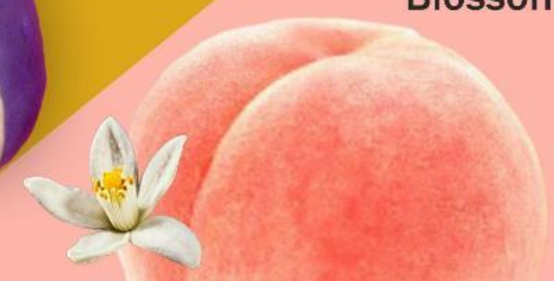
Pink Peach & Orange Blossom