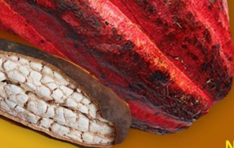
Nicaragua Cacao & Baobab