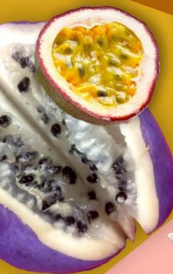
Passion Fruit & Akebi