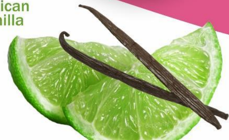
Lime & Mexican Vanilla